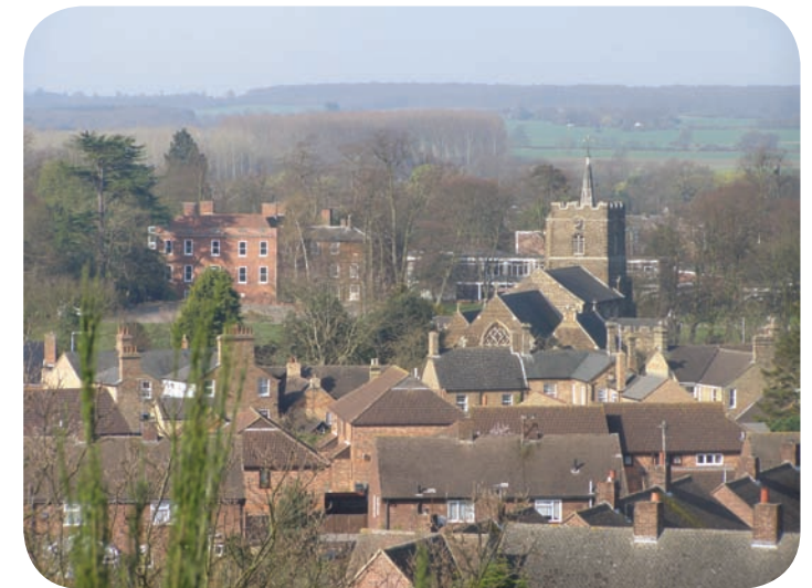
▲ Sandy viewed from the top of the Pinnacle

Population: 11,620 Unemployment rate: 7.9% Homes: 4,910 Bedford: 7 miles Cambridge: 24 miles London: 54 miles Peterborough: 35 miles