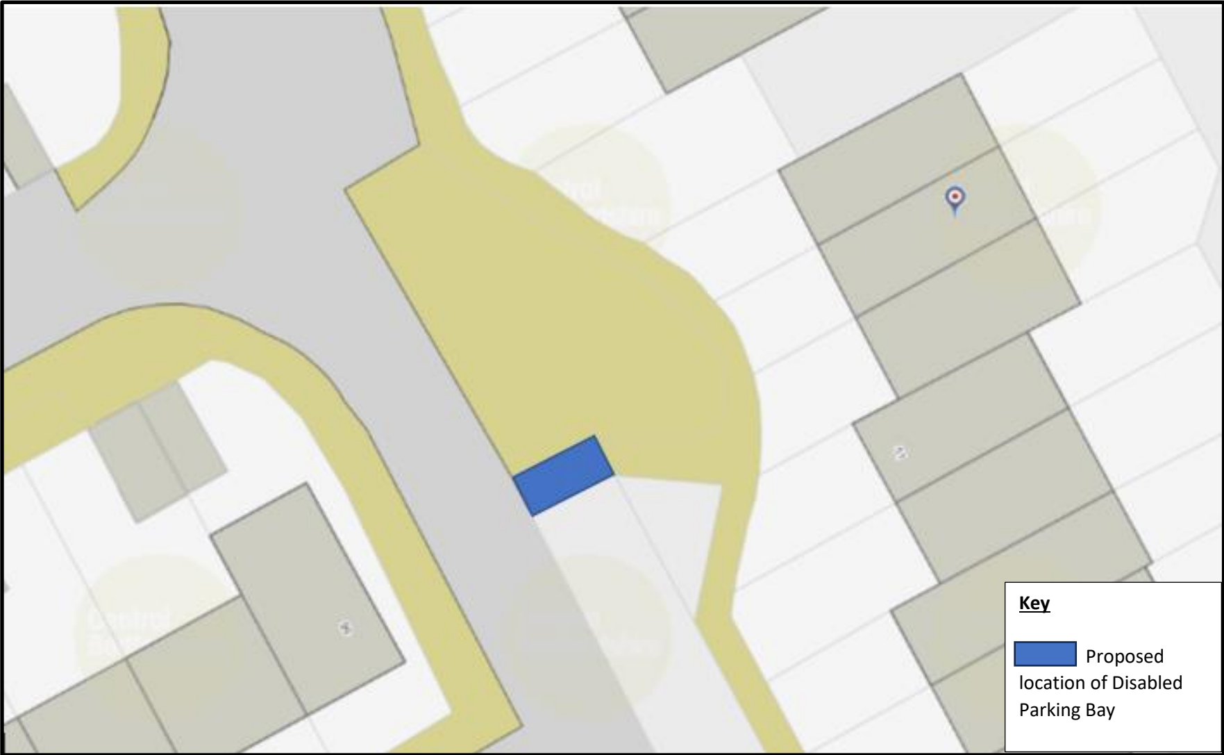
Winchester Road, Sandy north-east side, from a point 2.5m south-east of 47/49 common boundary and extending in a north-west direction, covering an area approximately 5 metres in length and 3 metres in width at a 90° angle.