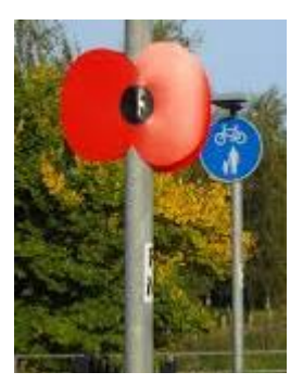
Example of lamppost event poppy