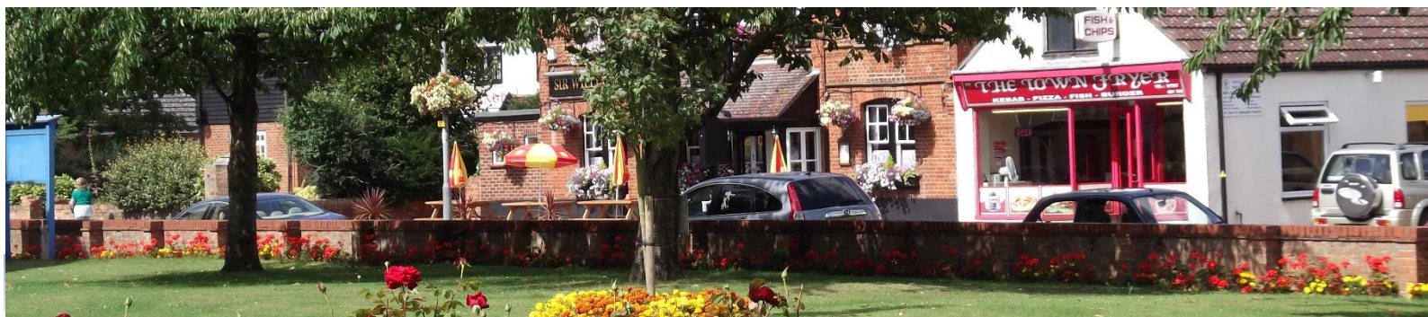
View of Sandy High Street from St Swithuns Churchyard

The years ahead will present many challenges for Sandy as a town and its council staff in particular. East-West rail, the future of the A1, new housing developments, the future of leisure provision in the town and in particular the Sandye Place site. The Council's responsibilities may well grow, and the new Town Council may have to start considering, sooner rather than later, whether the structure we have in place at the moment is the right one to deliver on future developments, goals and ambitions.