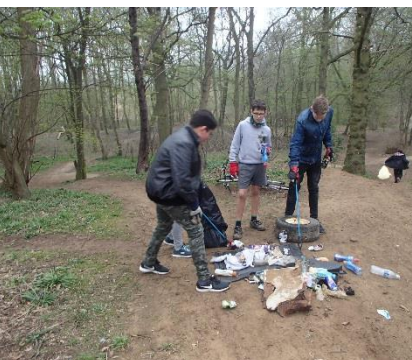
Community Litter Picking