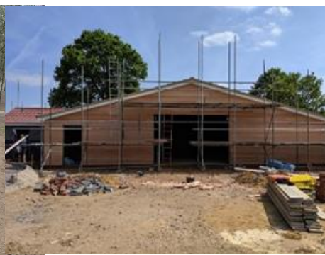
New Council Depot