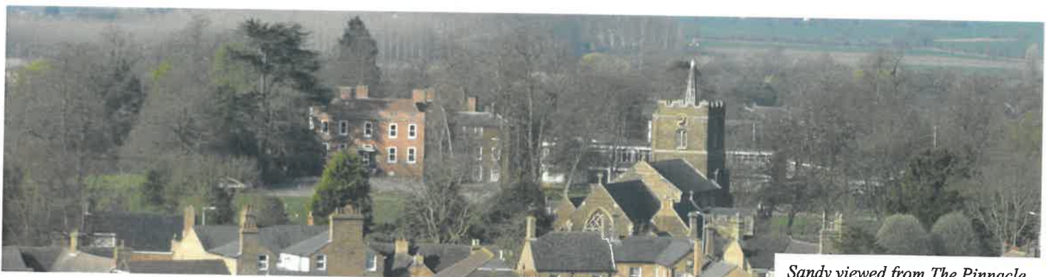
Sandy viewed from The Pinnacle