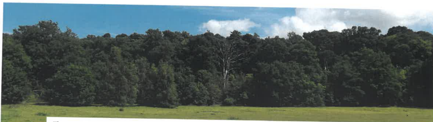
The Pinnacle is leased by the Council for the enjoyment of Sandy's residents. The Council maintains and manages the land.