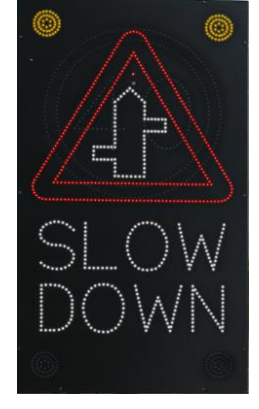
Examples of a vehicle activated sign (VAS), a Speed Indicator Device (SID) and a vehicle activated Hazard Warning Sign.